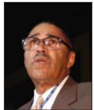
William L. Clay