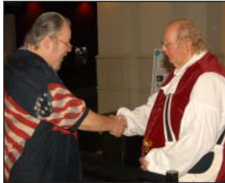
The genuine articles: On COPA Night, an all-American delegate meets an American icon, Benjamin Franklin.

"I am sorry for the embarrassing result and will replace each and every