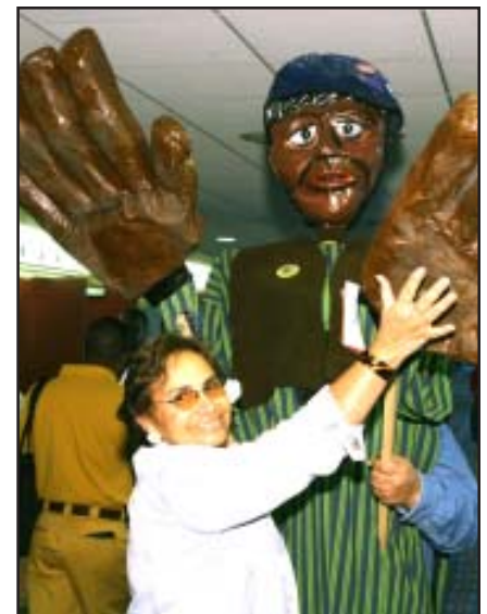
A delegate gives an extra-high high five to "Cesar Chavez."

For information, call 952-854-0093. Details also will be appearing on the Support Services Division pages at www.apwu.org .