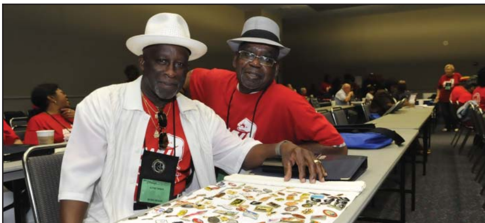
Retirees members catch up at the department's pre-convention conference.