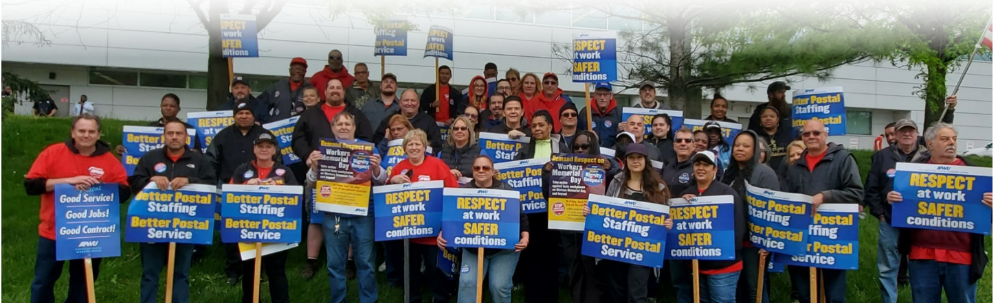
Members of the Philadelphia, Keystone, Lehigh Valley, Lancaster, and Eastern Montgomery County area locals, and the Pennsylvania APWU rally together in support of Better Staffing and Better Service on Workers Memorial Day 2023.

It is unacceptable that post offices nationwide face staffing shortages, which cause long lines and unfair delays to our community. We call on the Postal Service to sufficiently staff our post offices so the public receives the “prompt, reliable, and efficient” service mandated by law.