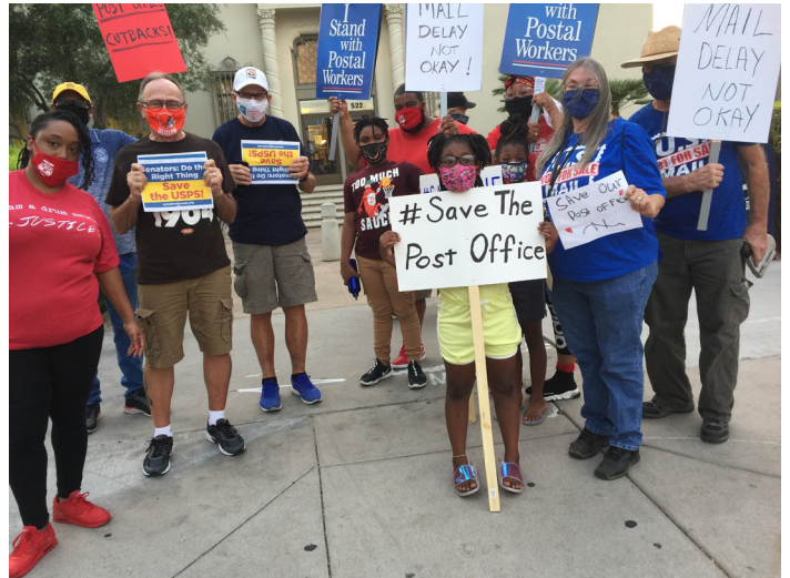
Phoenix Area Local